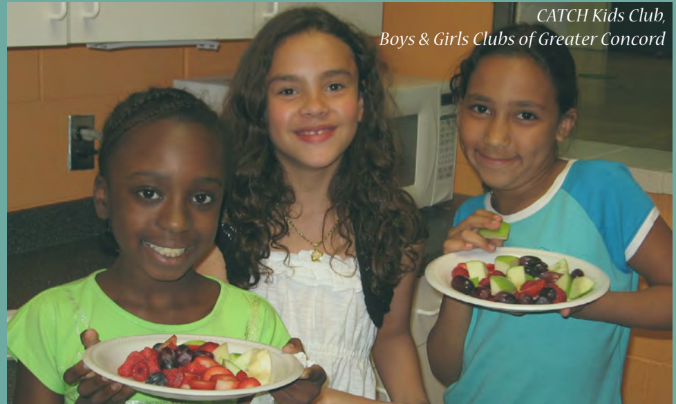
CATCH Kids Club, Boys & Girls Clubs of Greater Concord

A 2012 evaluation of the four original HEAL Grant Communities indicated that in three years, HEAL coalitions implemented the CATCH Kids Club in 17 afterschool programs, bringing increased physical activity and healthy food to elementary and middle-school children. The coalitions also introduced the Early Sprouts program to nine elementary school sites. Early Sprouts, developed by Keene State College, is a seed-to-table garden curriculum used to increase young children's food preferences for and consumption of fruits, vegetables, whole grains, and low-fat dairy products. It also promotes school and family-based dietary changes to reduce the risks associated with childhood overweight and obesity. 4 Making programs, such as Early Sprouts, available to early care centers throughout the state will accelerate progress toward decreasing childhood obesity rates.