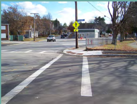
Wyatt Park, Laconia

“We had recently done road upgrades on the street sections adjacent to Wyatt Park, but we hadn’t addressed accessibility improvements to the adjacent sidewalk. The HEAL Grant initiative prompted us to revisit the pedestrian and active transportation needs at this site, and to broaden our view to accomplish similar improvements on other city roadway upgrade projects in the future.”