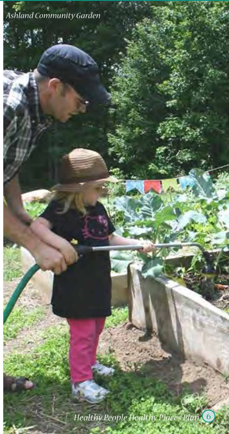
Ashland Community Garden

HEAL continues to evolve, it will increase its focus on state-level systems and policies change while expanding community-based efforts in order to have a greater impact on population health in New Hampshire.