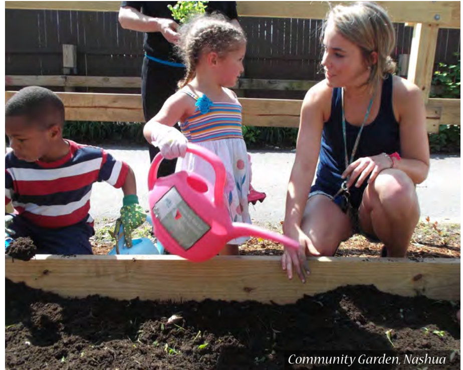
Community Garden, Nashua