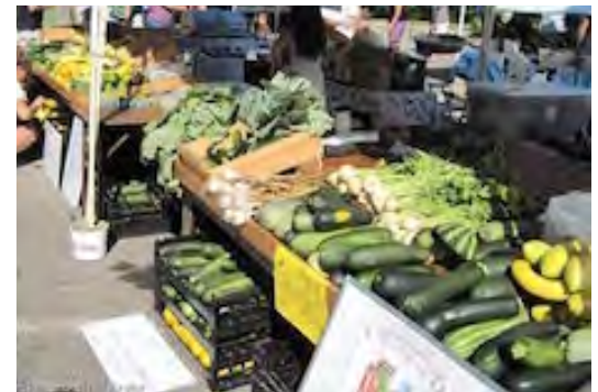
Farmers Market, Portsmouth

As we create healthier environments, where healthy food and safe places to walk and bike are more available, it is important to identify who has access to these environments. Overall, New Hampshire is one of the wealthiest, healthiest states in the nation. At the same time, many of our residents are faced with significant systemic barriers when it comes to accessing healthy food and active lifestyles. Communities with little or reduced access range from rural, isolated communities without basic grocery stores, to low income urban neighborhoods where safe, active recreation opportunities are few and far between. It is therefore a priority of the HPHP Network to address communities and populations with the greatest health disparities as New Hampshire moves forward with the HPHP Plan.