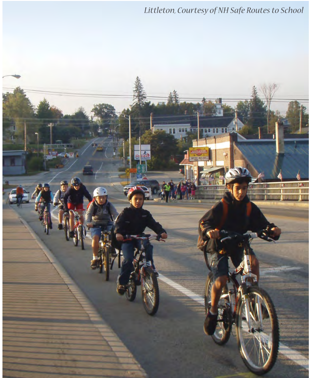
Littleton, Courtesy of NH Safe Routes to School

The HPHP Plan Theory of Change (see Appendix II) and Principles & Assumptions (see Appendix IV) informed the goals and strategies outlined in the HPHP Plan while providing a guide for strategies that support more equitable access to opportunities for healthy eating and active living throughout the state. This important work will be accomplished by building upon and expanding HEAL's ongoing community-level success, while working on policy, systems, and environmental changes at the state level. These combined efforts will amplify the HPHP Network's impact and accelerate its progress toward achieving the objectives outlined in the HPHP Plan.