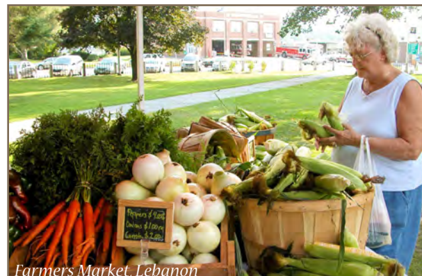
Farmers Market, Lebanon