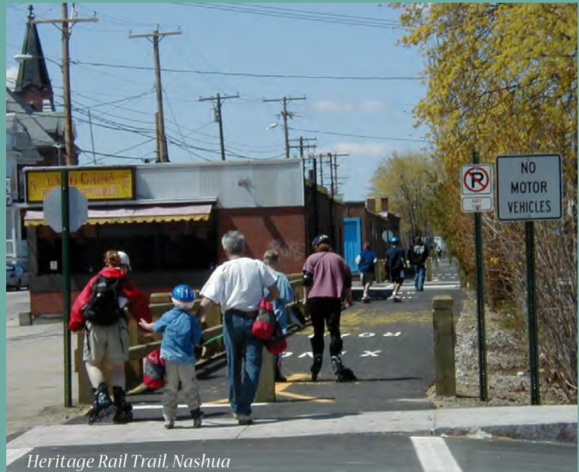
Heritage Rail Trail, Nashua

Heritage Rail Trail and Community Garden Project in Nashua