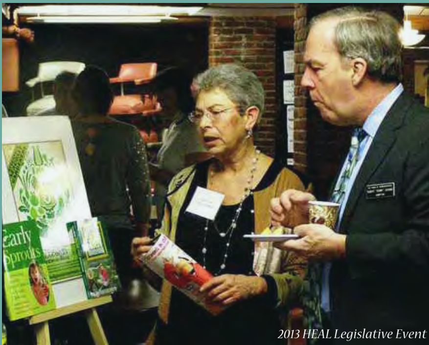
2013 HEAL Legislative Event

Upon reviewing several themes that emerged from the HEAL stakeholder interviews, partners representing multiple sectors worked together to define the next phase of HEAL in a broader context, reflective of the national movement toward policy, systems, and environmental change strategies. The partners concluded that a vision of “Healthy People Healthy Places” was needed for HEAL that included strategies at both the state and local levels. The result of this work is the 2014-2019 Healthy People Healthy Places Plan for New Hampshire.