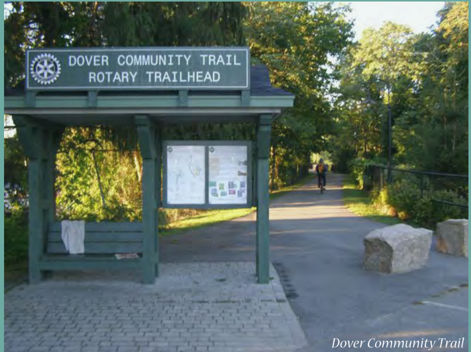
Dover Community Trail

Keene, Concord, Portsmouth, and Dover have all adopted Complete Streets policies in their community planning. Complete Streets policies, which promote safe streets for pedestrian and bicycle traffic in addition to vehicle traffic (see Appendix I: Glossary), help to set the conditions that promote more physical activity. While obesity reduction might be one long-term outcome, such policies also align with other health and community planning goals.