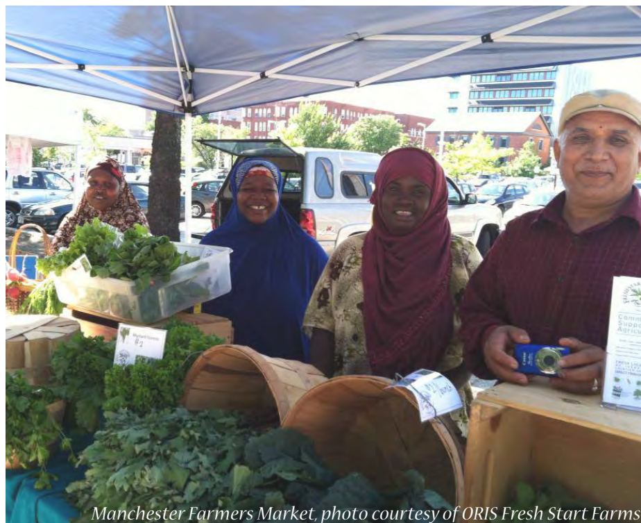
Manchester Farmers Market

These health outcomes are particularly poor in certain regions of the state and segments of the population. Adult obesity rates are highest in rural Coos County (see p. 14) and among children attending schools in the most racially and ethnically diverse inner city neighborhoods of Manchester and Nashua. Obesity and chronic disease rates are further exacerbated by higher household poverty levels in these areas.